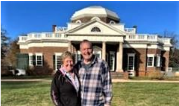
Home of Thomas Jefferson-Monticello

We visited the home of Thomas Jefferson known as Monticello near Charlottesville, VA. It's on the back side of older nickels. We toured the downstairs of the home seeing some of the original furnishings and decorations. Also walked the grounds to see the lovely garden and